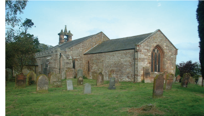
ST. MICHAEL AND ALL ANGEL'S CHURCH TORPENHOW